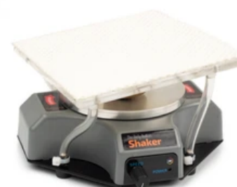
Belly Button Shaker