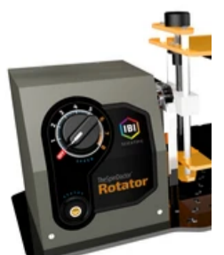
The Spin Dr