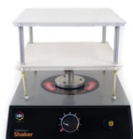
Belly Dancer Shaker - Start Up Kit