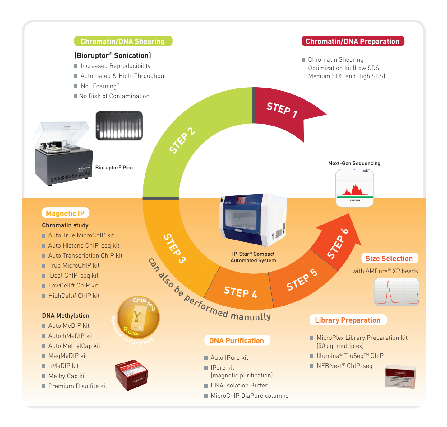
Figure 1. Diagenode provides a full suite of manual and automated solutions for ChIP experiments.

For Step 1, we offer products to isolate nuclei and chromatin. Step 2 describes reproducible sample shearing with the Bioruptor® product line. In Step 3 and Step 4, the Diagenode IP-Star® Compact provides error-free, walk-away automation for all your immunoprecipitation and antibody capture needs.